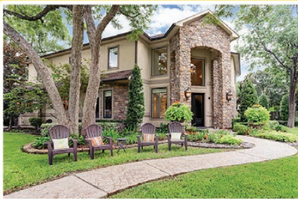
1316 NEELEY DR. 4 BEDROOMS / 3 BATHS / 2-1/2 BATHS $1,390,000

Spring Valley Village / First Floor Master