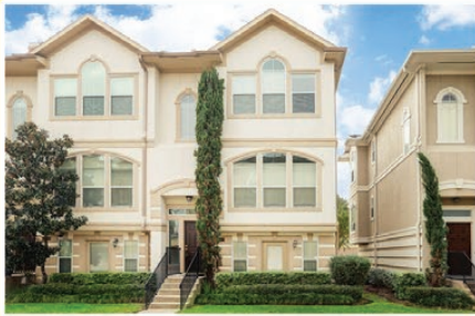
1707 FRENCH VILLAGE 3 BEDROOMS / 3 1/2 BATHS $315,000