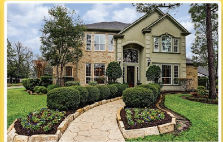
9001 LARSTON ST. 4 BEDROOMS / 3 BATHS / 2-1/2 BATHS $1,339,000