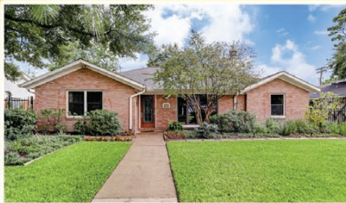
6911 SHAVELSON ST. 3 BEDROOMS / 2 BATHS $530,000

Spring Valley Village / First Floor Master