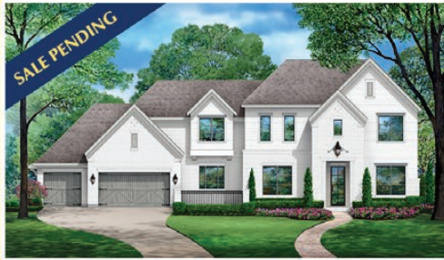
8638 CEDARBRAKE DRIVE 5 BEDROOMS / 5 1/2 BATHS $2,099,000

Spring Valley Village / 2 Bedrooms on First Floor