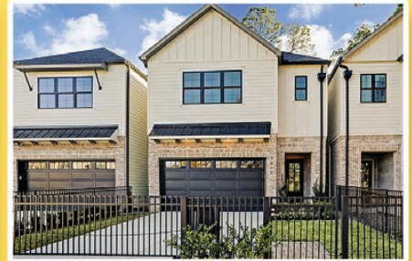
7815 AND 7817 JANAK DRIVE 3 OR 4 BEDROOMS / 4 1/2 BATHS $739,000 and $749,000

Spring Valley Village / 2 Bedrooms on First Floor