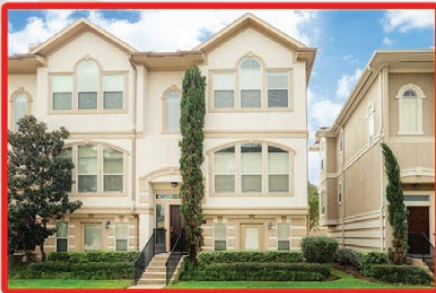
1707 FRENCH VILLAGE 3 BEDROOMS / 3 1/2 BATHS $320,000