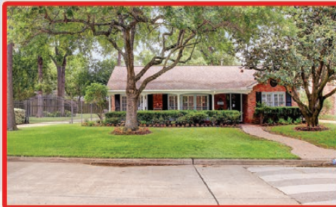
7210 NORTHAMPTON 3 BEDROOMS / 2 BATHS $635,000

Spring Valley Village / First Floor Master