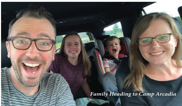
Family Heading to Camp Arcadia