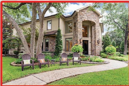
1316 NEELEY DR. 4 BDRMS/3 FULL BTHS/2 HALF BTHS $1,365,000

Gated Community/ Spring Branch Location/ 'Lock and Leave'