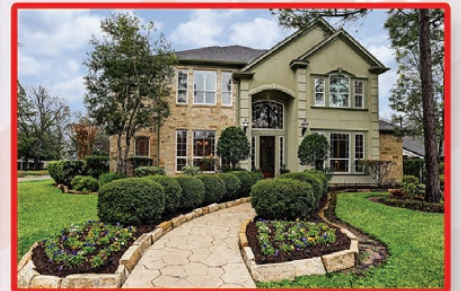
9001 LARSTON ST. 4 BDRMS/3 FULL BTHS/2 HALF BTH $1,299,000

Afton Village/Oversized Lot/Beautiful Hardwoods