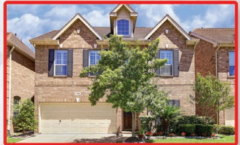
1306 W PARK AT SHADY VILLA 3 OR 4 BEDROOMS/3 1/2 BATHS $444,000

Gated Community/ Spring Branch Location/ 'Lock and Leave'